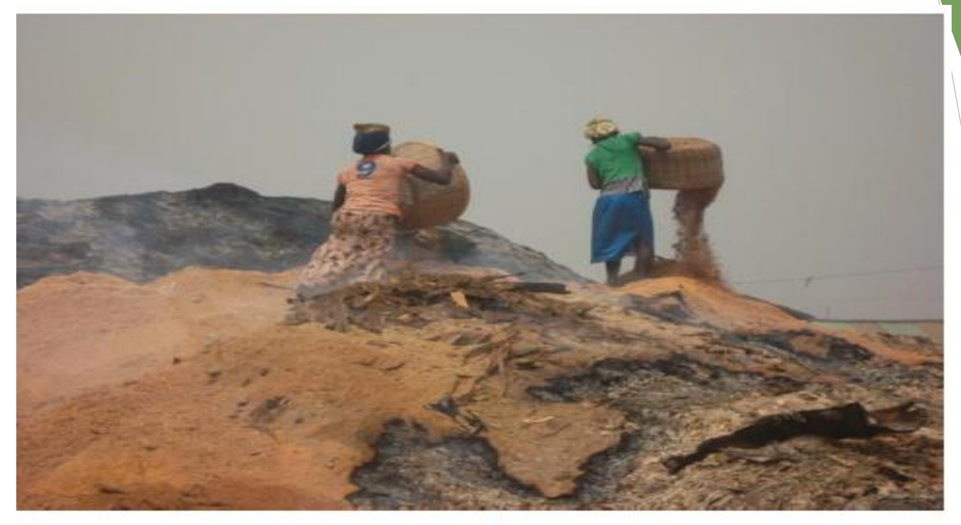
Workers paid to collect waste from sawmills to the dumpsite for burning in Lagos slum