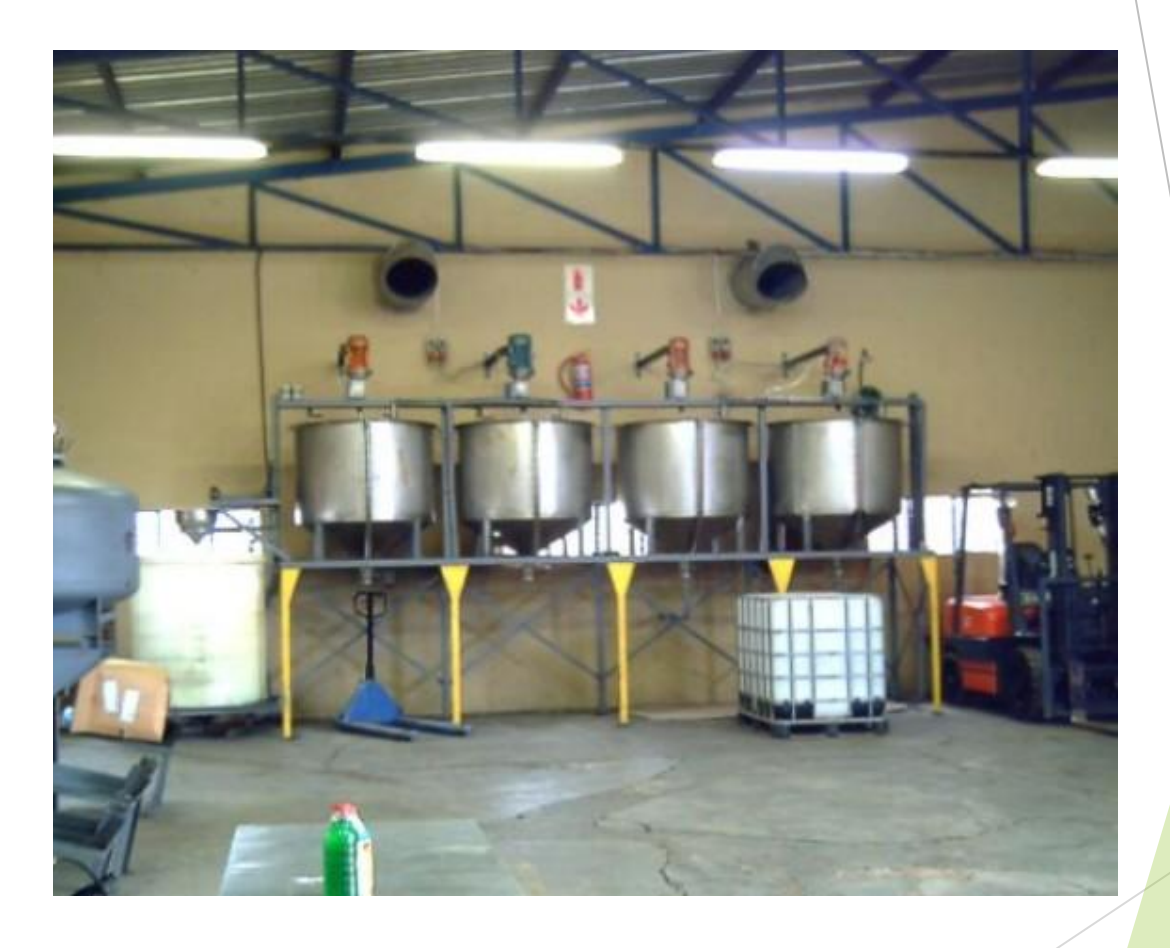
GEB Modular Micro Distillery Plant