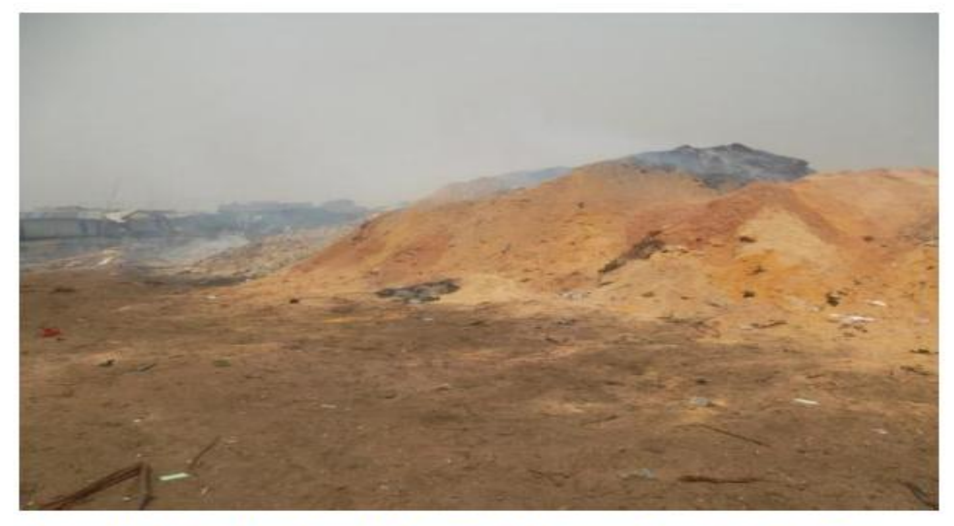
A stack of sawdust waste burning in open air in the Lagos slum